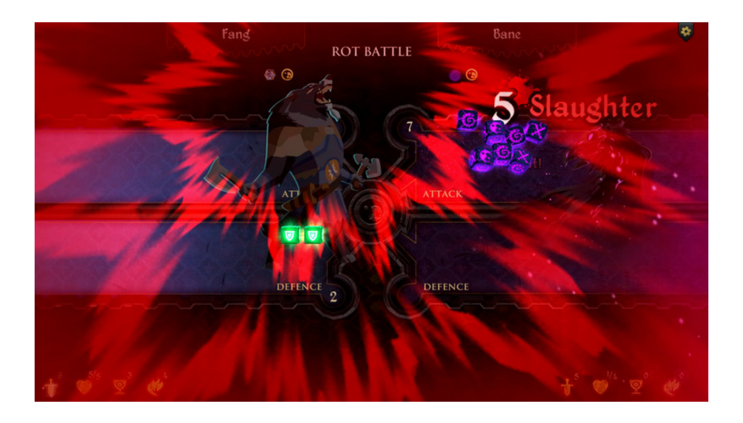
Armello - Rivals Hero Pack Download For Windows 10

Download >>> <a href="http://bit.ly/2JZf2UQ">http://bit.ly/2JZf2UQ</a>