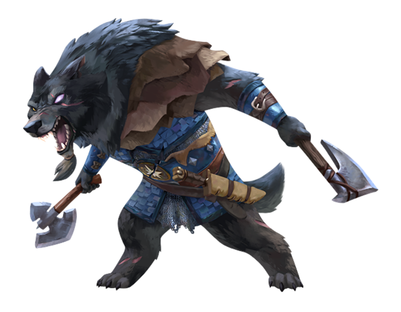
Fang, The Exiled

The exiled heir to the Wolf Clan throne. Savage and scorned.