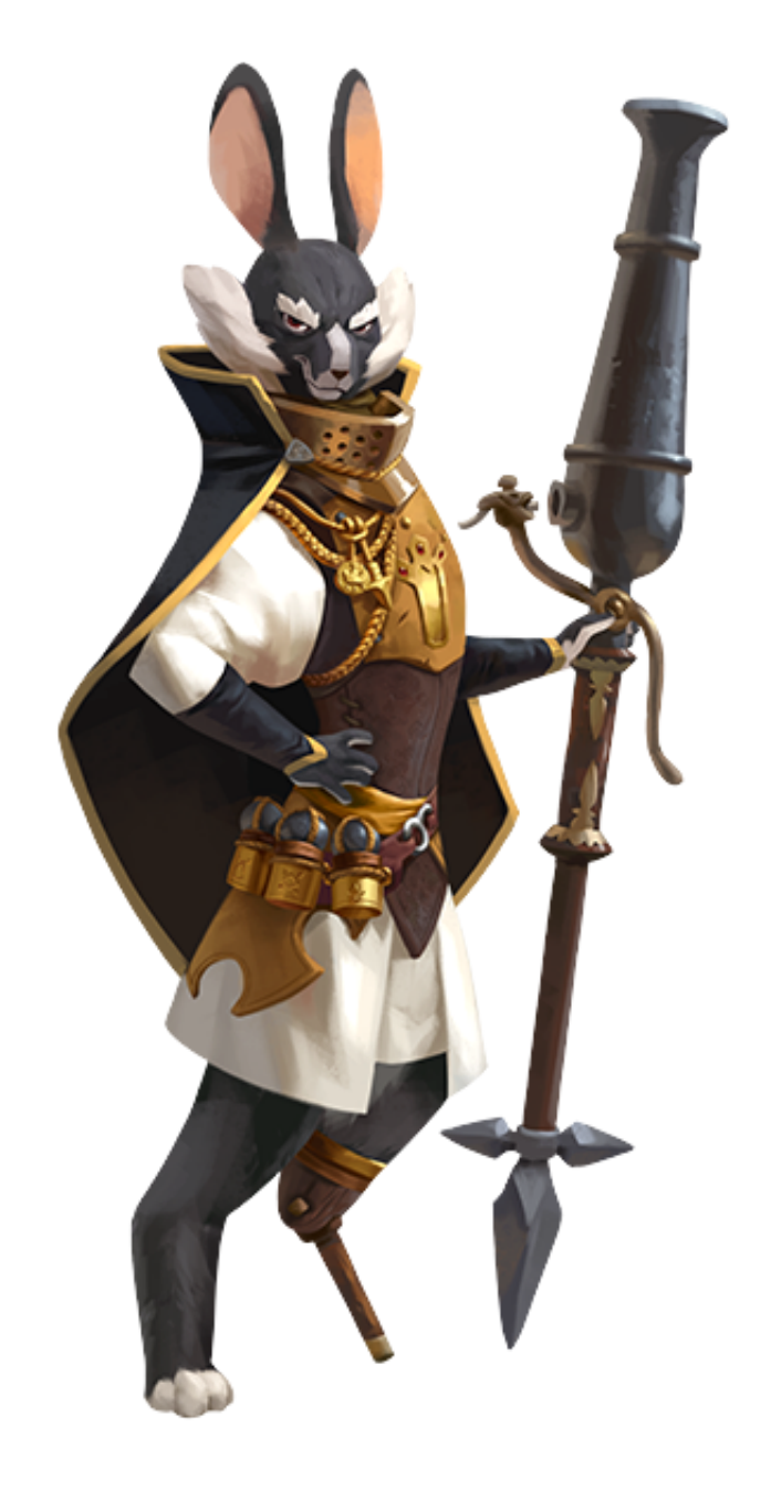
Hargrave, Thunder Earl

Once atop Rabbit nobility, a decorated general with a dangerous dash of senility.