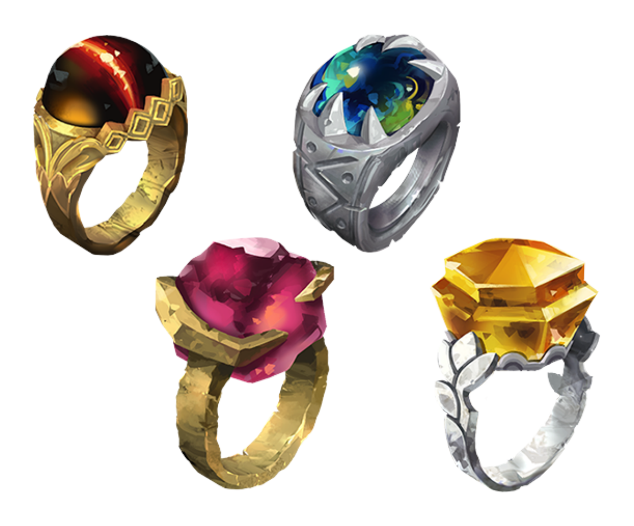
Cat's Eye, Spinel, Chrysocolla, Taaffeite