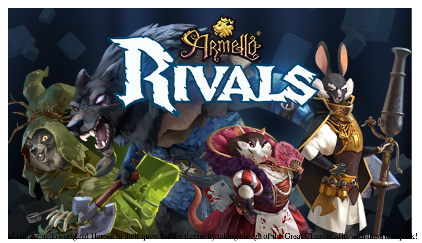
Includes four new playable Heroes, one new Amulet, and four new Rings!