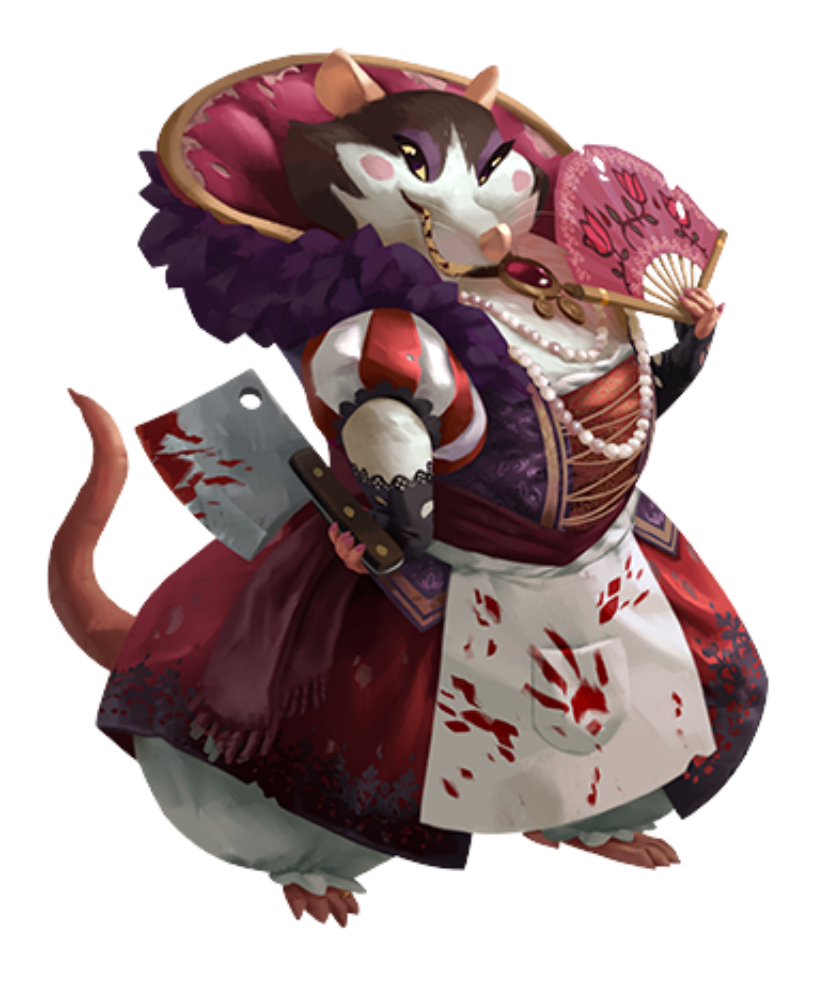
Griotte, Butcher Baroness

A devilish, double-crossing rat, with double the personality.